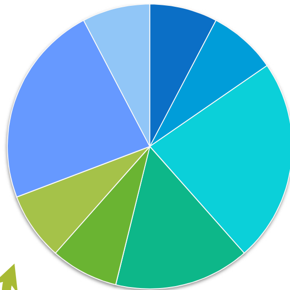
Disease area per funded project